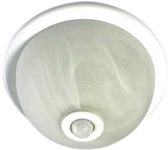
MODEL : HC 25A

HC-25A (Ceiling Light with PIR Sensor) can detect the infrared rays released by human motion within the detection area, and then start the in built load -light automatically. The unit is for indoor use only. HC-25A is the ceiling lamp, it is IP20 waterproof class. The customers usually install this sensor in the living room, restroom, corridor, and verandah.